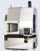
VTL - Vertical Turret Lathe