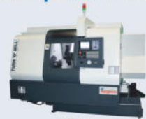
TOM - Turmill Center